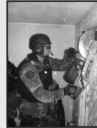
A SWAT team member breeches a door during a training exercise inside 159 Douglas Street, one of NeighborWorks® Greater Manchester's six properties in the West Granite neighborhood.